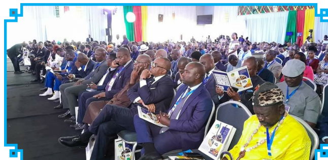
Cross-section of participants

The CNSC present at the Cameroon Investment Forum.